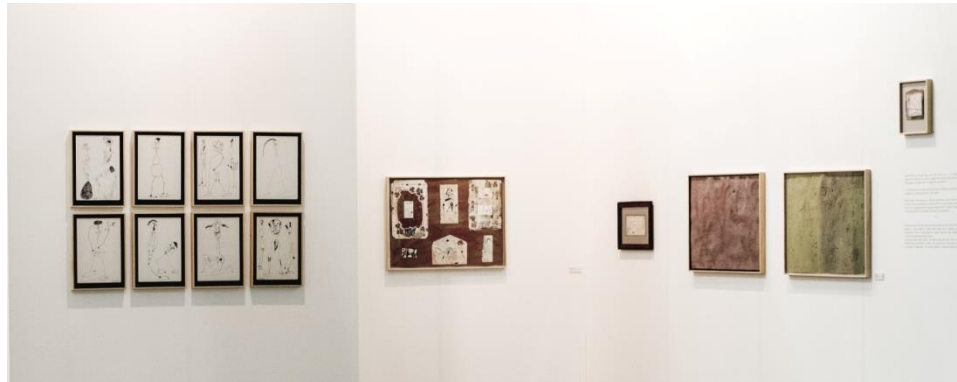
Rafael Pérez Hernando Gallery @ Artissima Torino 2015

We exhibited some small-medium artworks on paper of the 80's in our first year at Artissima Torino in 2015. This time we want to show at Artissima 2019 a very special big cardboard painted in 1985.