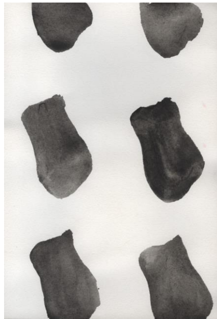
untitled, 2009 acrylic on papers 27 x 18 cm