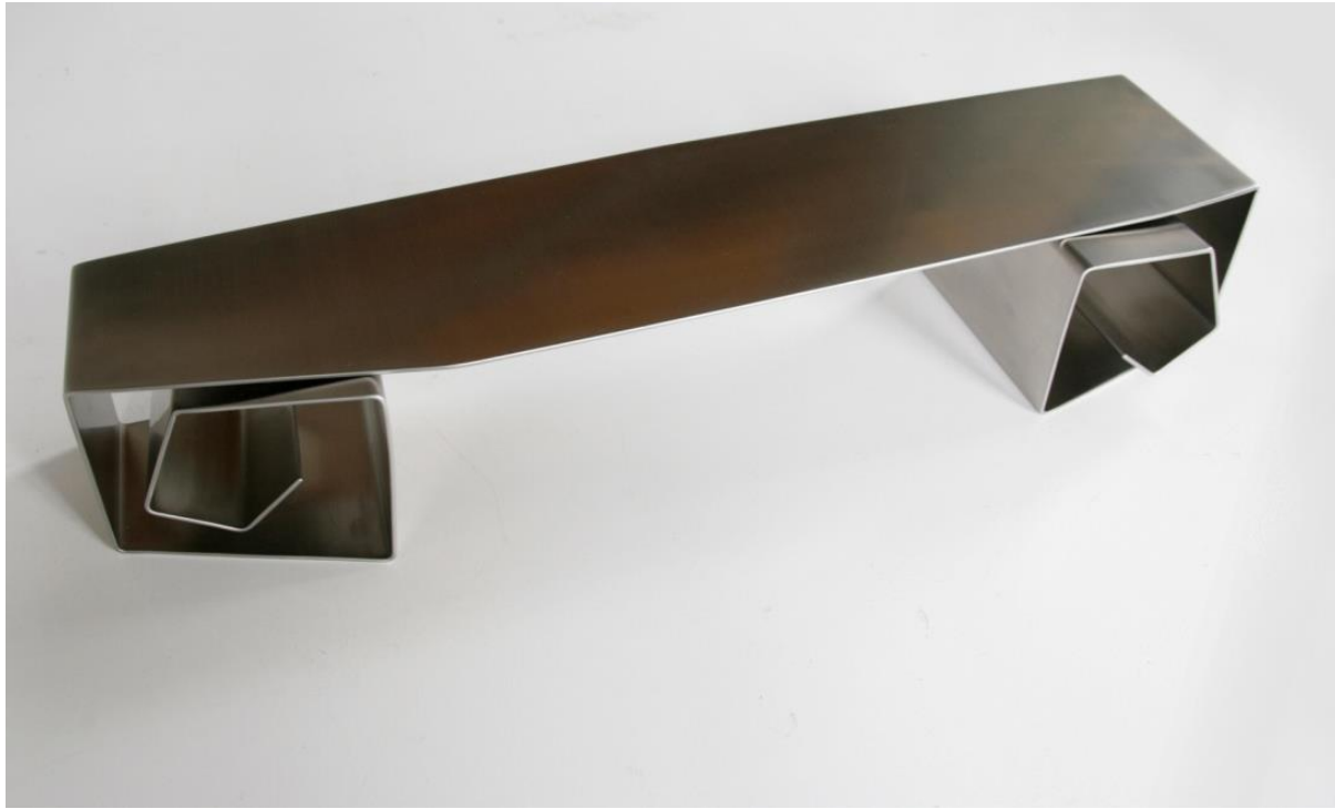
voluta II, 2016 stainless steel 12 x 70 x 18,5 cm 3/3 edition