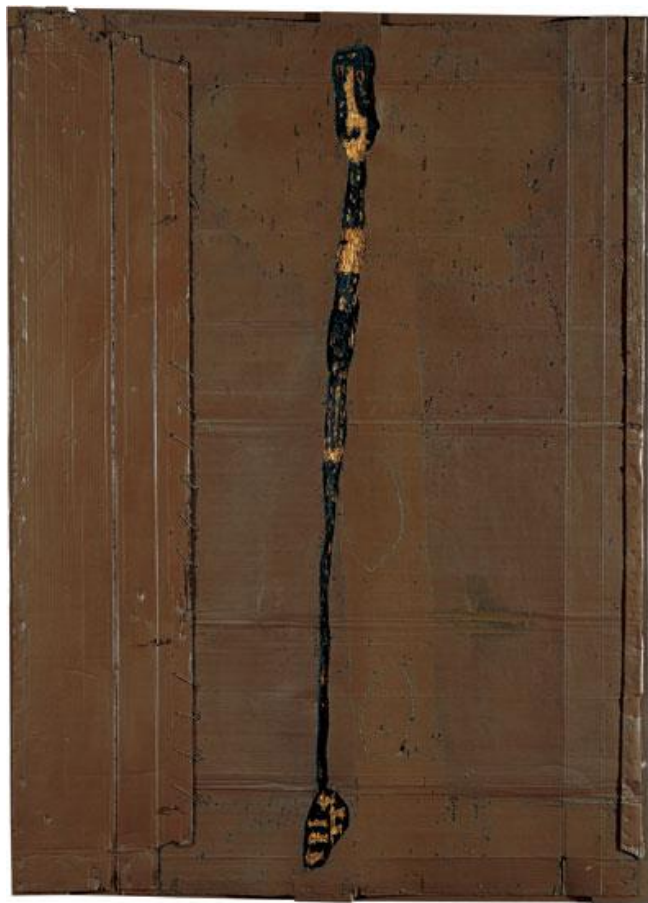
porcallos, 1985 mixed media on cardboard 250 x 180 cm